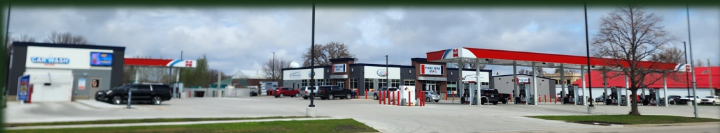
Petro Serve USA has opened its brand new Langer location, offering all the wares of convenience, including hot lunch, a great coffee station, grocery items, and a carwash!