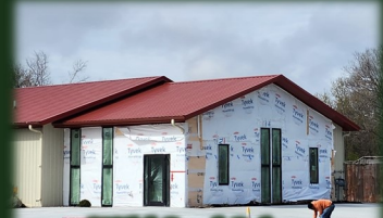
Wild Soul Salon is under construction