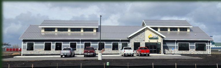
Maple River Grain & Agronomy's 13,000 square foot new office building is ready for move in and the company is breaking ground on an expansion of its fertilizer storage facility on Heartland Ave in the Industrial Park.

Contact the city office to ask how you can get involved!