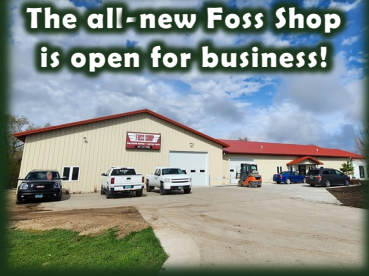
The all-new Foss Shop is open for business!

The Governor's Office Park Building is getting a facelift and some new businesses!